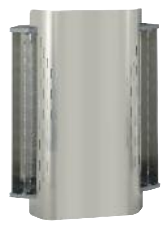
WMG 20-1100 Registration pending in CO, HI, IN, NM and WY as of August 2008.